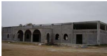
Pete Beal; Exterior view of the Multipurpose Building- Mexico Campus

In January, Pete Beal from Dix, IL completed the electrical wiring of the multipurpose building in the Mexico Campus. This project was started by the Versailles, MO work team the last week of December 2005. Currently work is being done on the finishings of the kitchen ceiling. Many thanks to all who continue to support the multipurpose building project with finances and prayers.