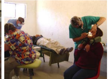
Dentists at work in the Mexico Campus.