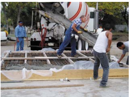
Irrigation Canal. Cement being poured to build the bridge.