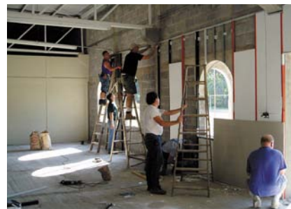
Work Group from Southwest Christian Church, Austin, Texas. Men installing the insulation in the Mexico Campus Multipurpose Building.