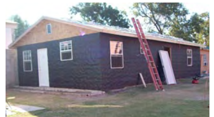
SWCC team hard at work on the staff house construction project..

Come see us in Booth 1226 at the National Missionary Convention November 20-23 • Tulsa, OK