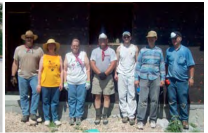
Working on the cement foundation. Team from Versailles, Missouri.